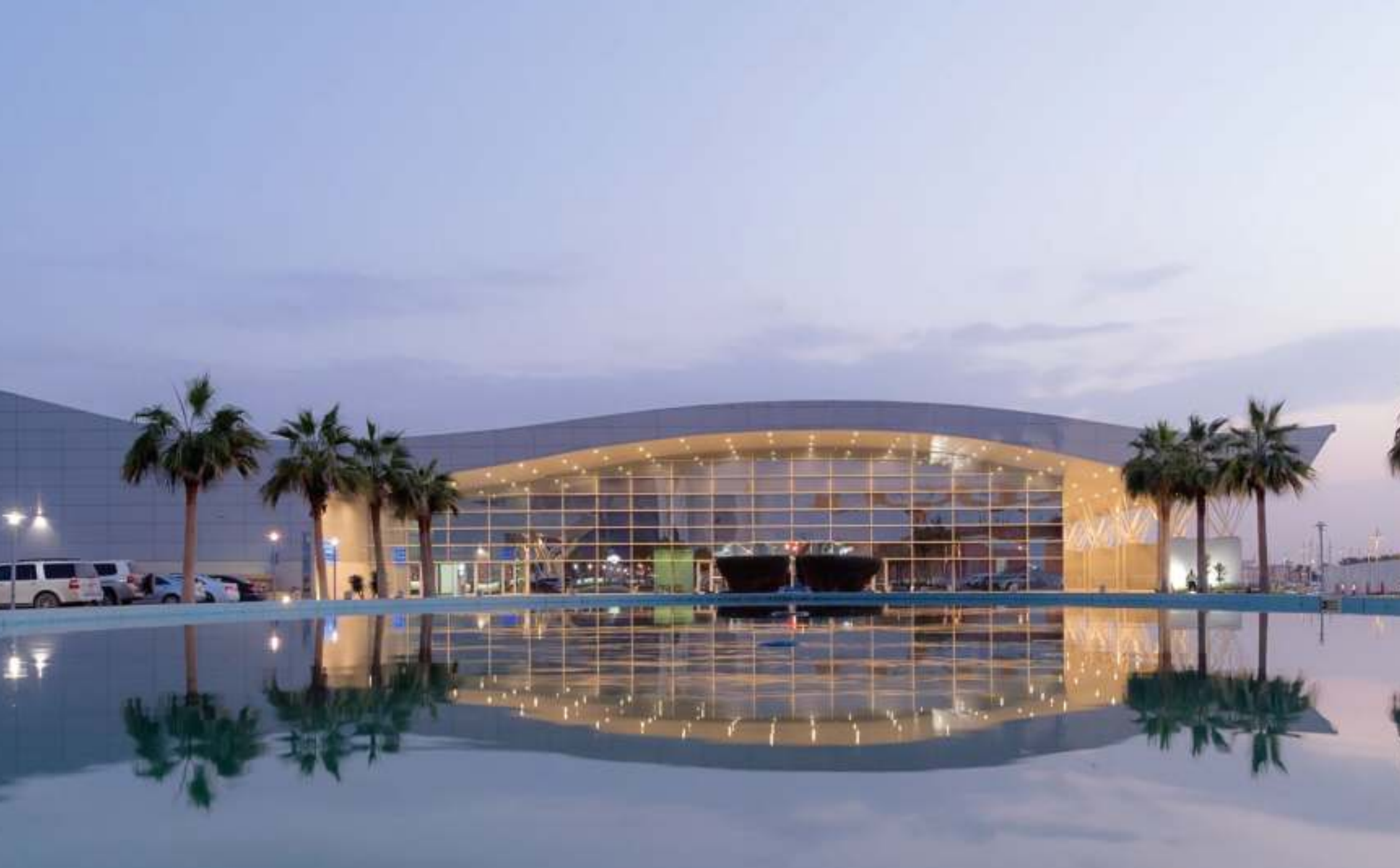
Riyadh International Convention & Exhibition Center